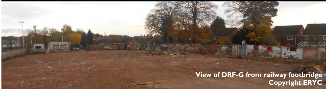
View of DRF-G from railway footbridge