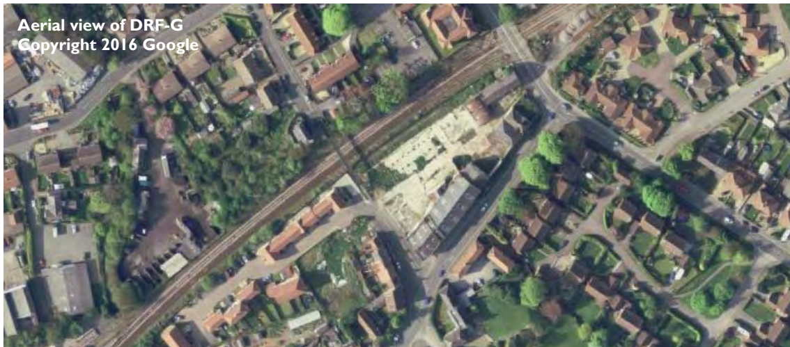
Aerial view of DRF-G