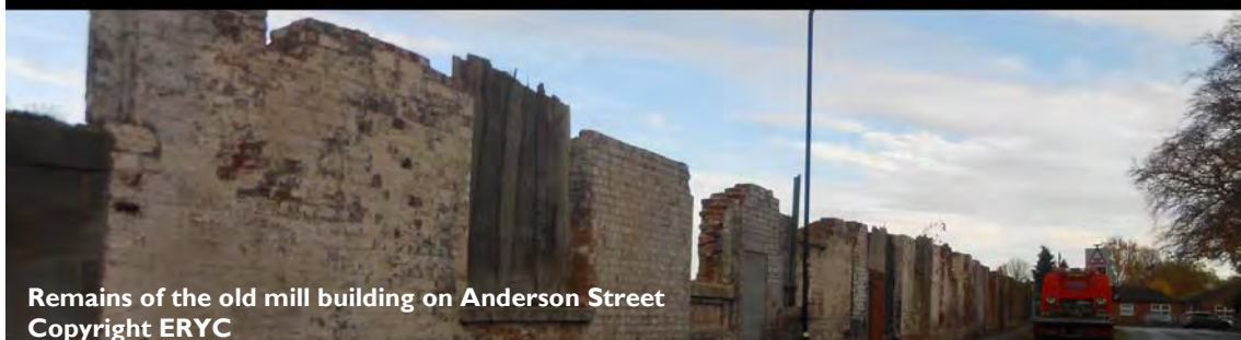
Remains of the old mill building on Anderson Street