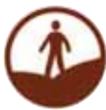
The access symbol

In addition, the Secretary of State has the power under the CROW Act to extend the access right to coastal land by order.